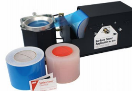
Surface Saver Plus