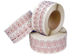
10% Discount on 3+ Rolls!